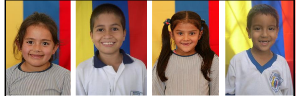
These children are all available for sponsorship at www.lacc4hope.org

We need your prayers! We trust God has prepared a way for us to leave for the field at the end of August, but we need a miracle to get there! Please continue to pray that doors of financial blessing will continue to open. We have been so blessed while raising our funds and we can't wait to see how God is going to blow us away in these last few weeks.