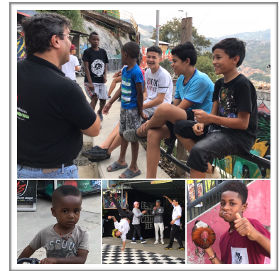
Before quarantine in Comuna 13.

✦ Please pray for Colombia, our pastors and churches who are hurting and the families of Comuna 13.