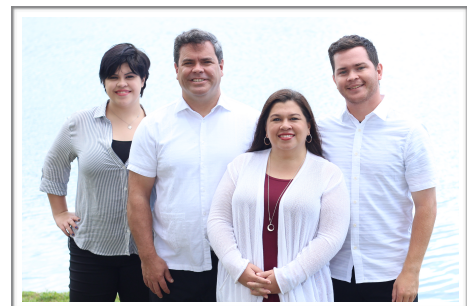
We are grateful for unexpected family time.