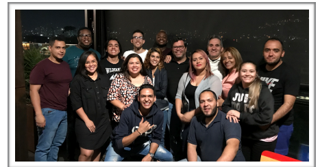
A farewell dinner with some of our closest friends and ministry partners.