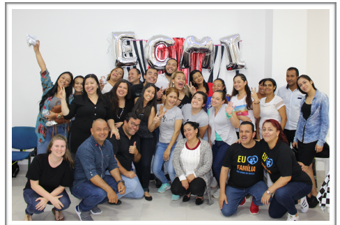
End of the year celebration with children's ministry coordinators.

This year there were 26 presentations of Supernatural Kids. 2001 people attended - 1334 kids and 667 adults.