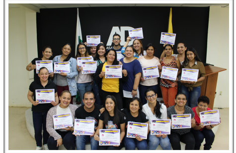
Leaders who recently completed the last level of the national children's ministry training program.

One way we have seen this team grow is through our annual evangelism activity called Supernatural Kids. Every year we create a program that teaches families aspects about the Holy Spirit. This year's emphasis was that the Holy Spirit helps us manage our emotions. We hold a workshop in September to teach the program to the local churches and throughout the end of October and beginning of November, the teams present the program either in their church or out in a public place such as a park or on the street.