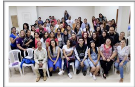
Above: Children's ministry leaders and teachers taking classes this year.

This year has been a year of tremendous growth in Children's Ministry. We are in our third year of working with coordinators from most of the churches in the state. This year we launched a new teacher's class and had over 35 students take part. This month we took part in planning this year's Megacapacitación where pastors and lay leaders could choose between seven different ministry areas to deepen their knowledge and training. In the children's ministry department we had 76 participants, going well beyond last year's numbers. In total nearly 400 people attended the event.