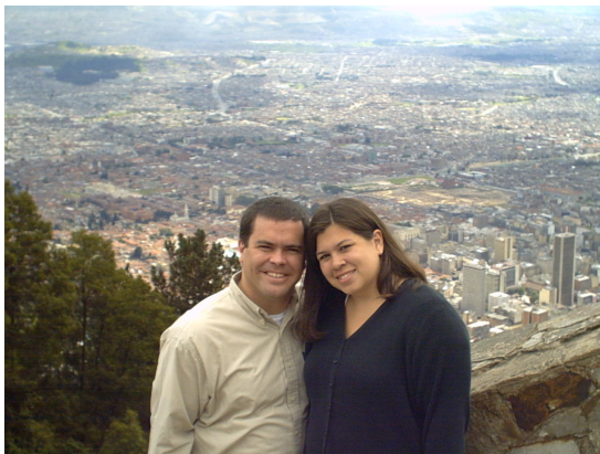
Our Mission Field