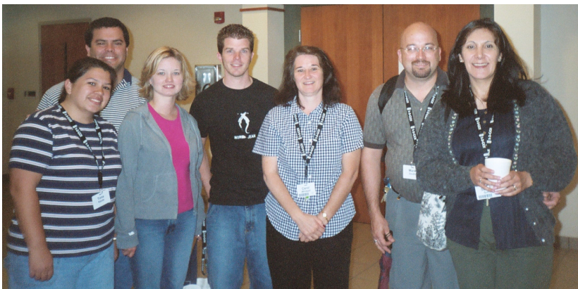
The Tacos Locos - our team for Pre-Field Orientation. We are all Missionary Associates going to Latin America.