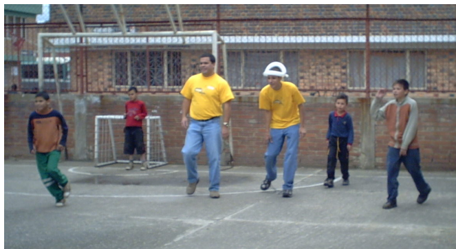
A pick-up game of soccer with the neighborhood kids.