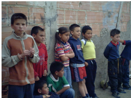
While in Funza we took our skits and songs to the streets to reach the children in the area.