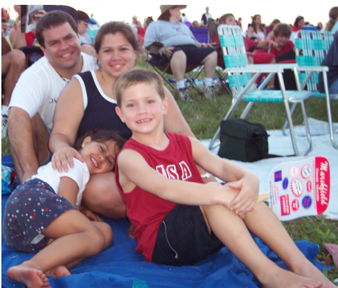
We enjoyed July 4th at the James River Assembly of God "I Love America Celebration"