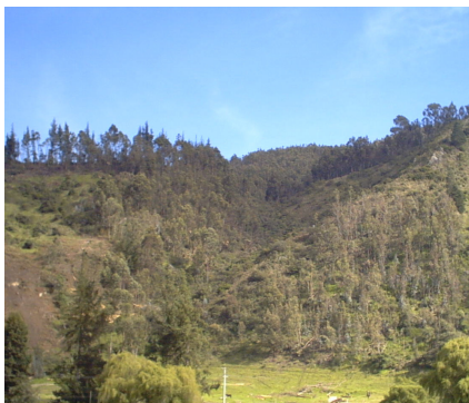
The beautiful view from our cabins.