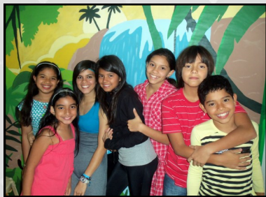
Some of Pre-Adolescent Kids