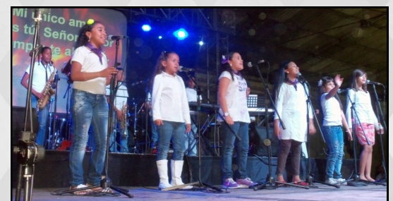
All-kids praise band singing during the event.

You can read his entire story at our blog on www.kautzfamily.org .