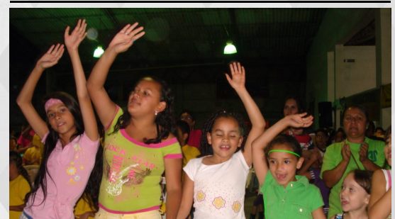
Girls singing and praising