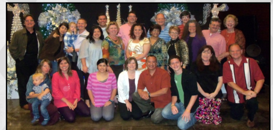
Thanksgiving with our fellow missionaries.