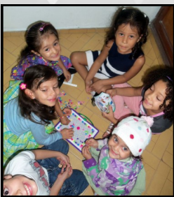
Some of our Pre-K Kids

We've seen our local church's children's ministry grow from 40 to 60 children and had the opportunity to train children's church teachers and leaders all over the city. Looking ahead to 2013 we expect many more exciting events and growth in our city and churches.