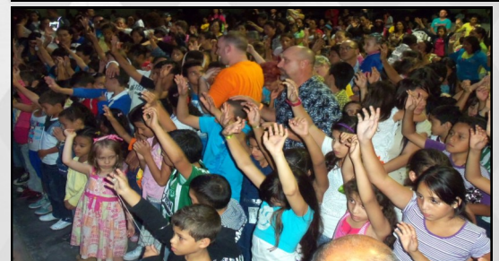
Prayer time during the Supernatural Kids event